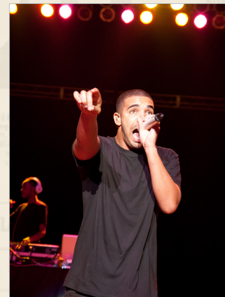
Drake’s song “In My Feelings” is at number one this summer.

What other future memory-triggering songs will hit number one this summer? We’ll just have to wait and see. But thanks to the creativity of all the songwriters and performers, songs will continue to bring back memories of summers past. 🎧