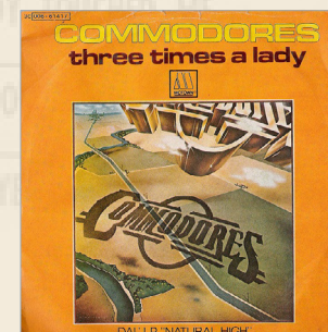
Simon and Garfunkel's "Mrs. Robinson" and The Commodores' "Three Times a Lady" were both number one songs in the summer of '68 and '78 respectively.