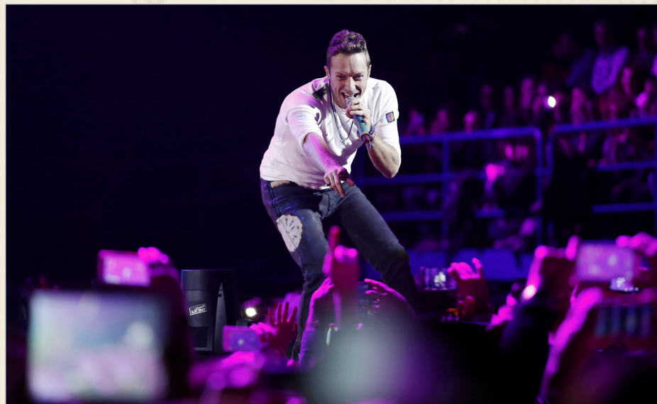
The band Coldplay hit the top spot in the Hot 100 charts with the song “Viva La Vida” in the summer of 2008.